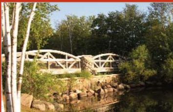
The Foot Bridge at Lincoln Woods

District 17 has some of the most scenic locations to be found anywhere in Rhode Island. The District View is creating an ongoing photo gallery of the images that make our district so special. If you would like to submit a photo, please click here .